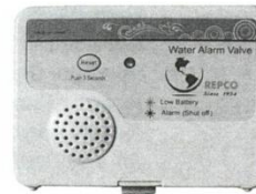
Water Alarm Valve for Bubble-Up® Interactive™