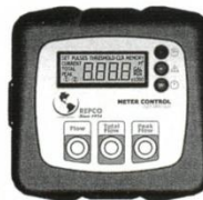
Meter Control for Bubble-Up® Interactive™ Units