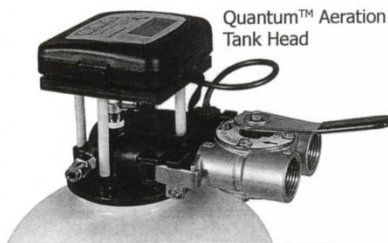
Quantum™ Aeration Tank Head